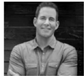
Tarek El Moussa